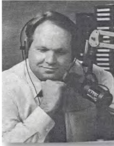
Rush Limbaugh during his KFBK radio days, circa 1985.

Love him or hate him, one thing about Rush Limbaugh is certain—he was by far the biggest name ever to come out of the Sacramento radio market. His passing on February 17 turned into an Old Home Week of sorts for the folks who worked with Rush during his early years at KFBK, as former and current staffers reached out to each other on the air and in social media. A common thread emerged—the Rush they knew was not the Rush the public perceived.